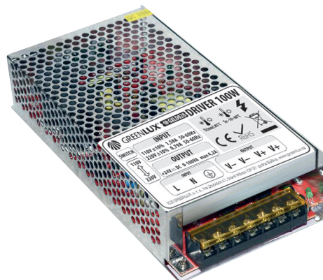
DRIVER LED 24V IP20 100W