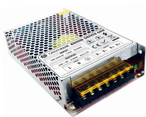
DRIVER LED 24V IP20 60W