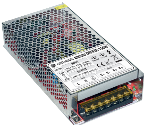
DRIVER LED 24V IP20 150W